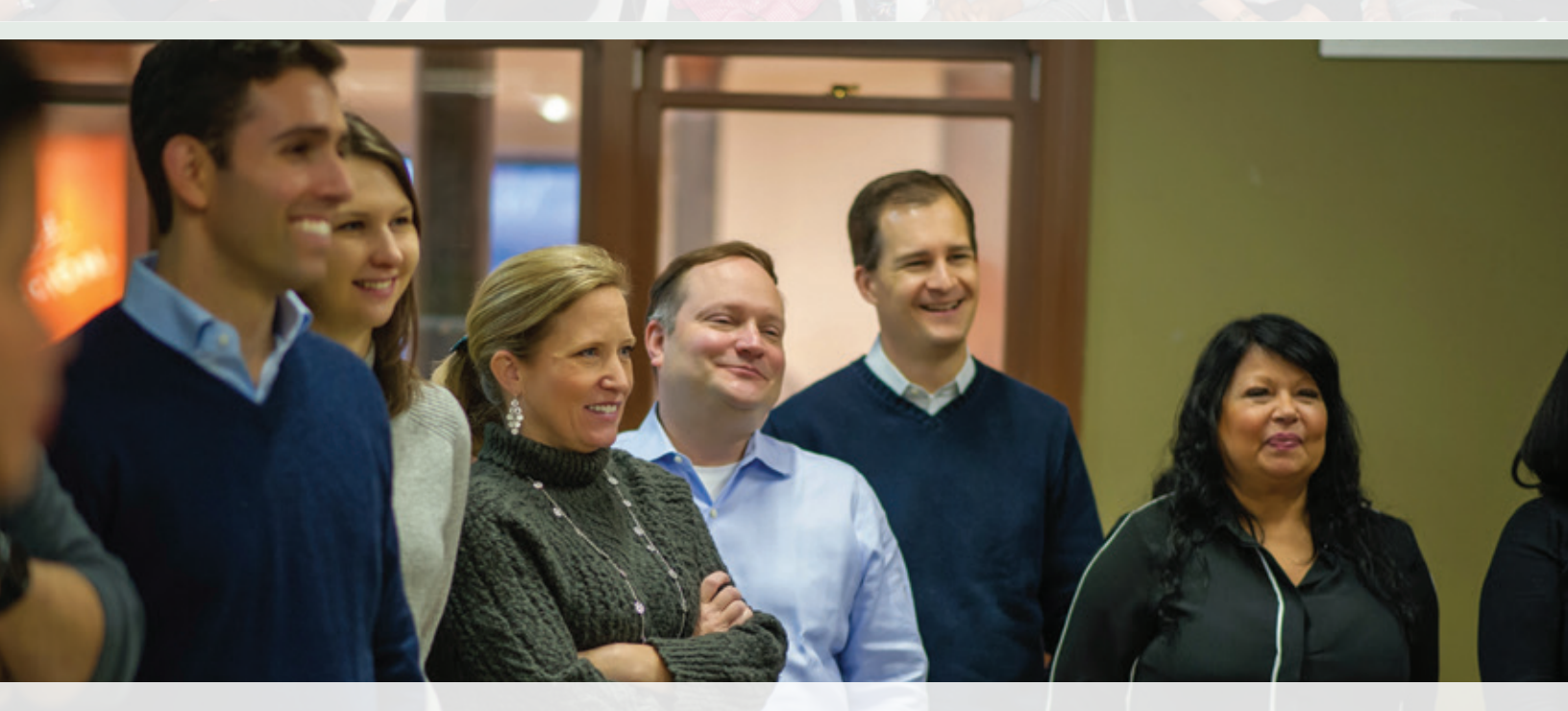
Volunteering at the West Side Campaign Against Hunger