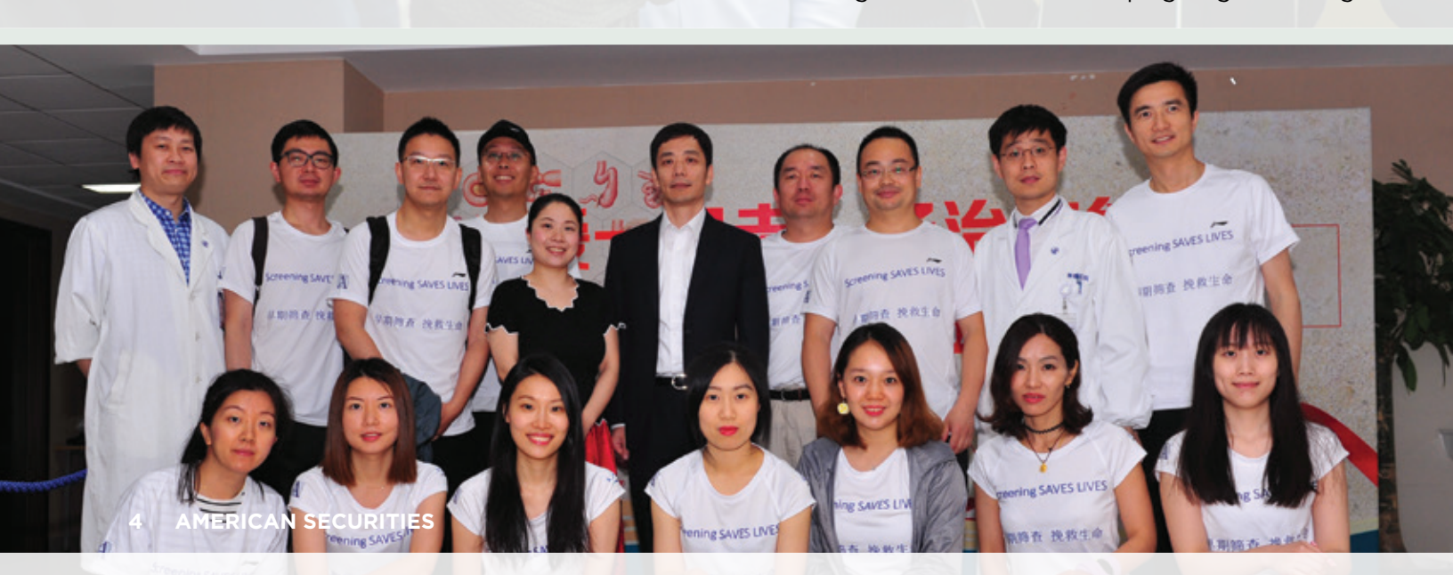
Volunteering at the Shanghai Cancer Center